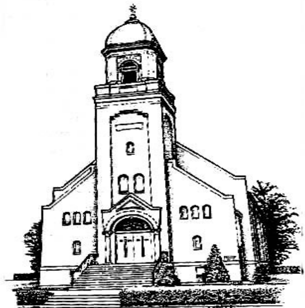
Byzantine Church of St. John (St. John the Baptist Byzantine Catholic Church/St. John the Baptist Greek Catholic Church) - Minneapolis, MN.

Unlike the first Rusyn settlers, these Rusyns did not originate from a single village area, but represented a cross-section of many villages in Carpathian Rus. This included the villages of Habura, Piskorovce, Kalinov, and Pcoline in Zemplin County and Regetovka, Krurov, and Komlosa (today Chemlova) in Saros County of present day Slovakia and the villages of Ljuta and Horlovo which today are in Ukraine.