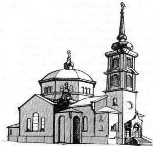
St. Mary's Orthodox Cathedral (St. Mary's Russian Orthodox Greek Catholic Church), Minneapolis, MN.