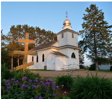
Lublin, WI – Holy Assumption Orthodox Church. Established in 1908 and still active.