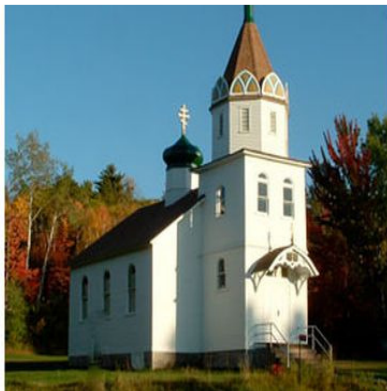
Cornucopia, WI - St Mary's Orthodox Church. Established in 1906 and still active.