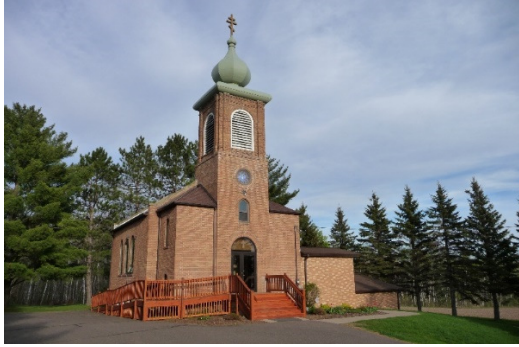
Clayton, WI – Holy Trinity Orthodox Church. Established in 1902 and still active today. This picture and other historical Info is available at www.htocclayton.org